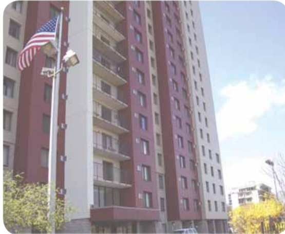
Touring by Appointment Only